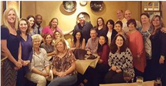
The NJ delegation in Orlando, FL