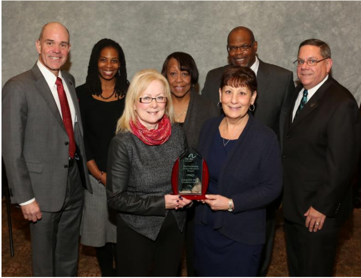
Pictured above: Members of the Community Living Education Project who were honored at the 2015 Awards Dinner.

The Arc of New Jersey is pleased to announce the recipients of the 2016 Annual Awards, honoring individuals, organizations and corporations for their efforts on behalf of children and adults with intellectual and developmental disabilities and their families.