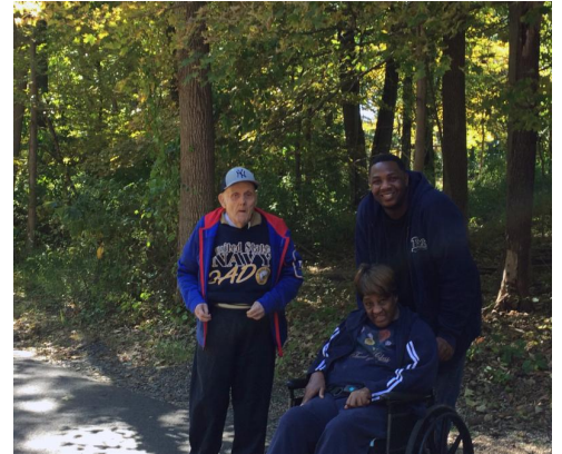
Pictured above: Self-Advocates enjoy an day of education and fun at Watchung Reservation.

The New Jersey Self-Advocacy Project visited Masker's Barn at Watchung Reservation, as part of the Healthy Lifestyles Project (HLP), on Wednesday, October 5. HLP is a project of The Arc of New Jersey and receives funding through a grant awarded by the Horizon Foundation for New Jersey. The goal of the project is to provide people with I/DD with functional education about the importance of health choices related to diet, exercise, and stress management. The event at Watchung Reservation included adaptive yoga, a Get Fit Session, lunch, and a group trail walk.