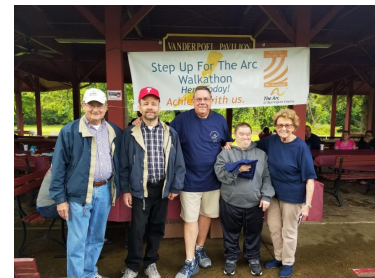
The Arc of Burlington's Walkathon on May 20th