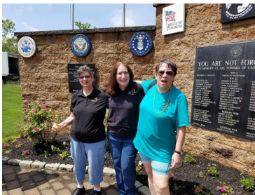
The Arc of Camden's Walkathon at Lindenwood Memorial Park