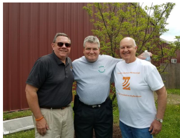
SCARC's 2018 Gordon Shelton Memorial Walk-a-thon