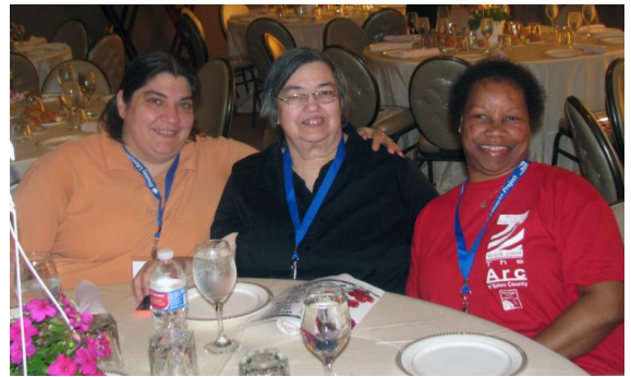
Self-Advocates pictured at the 2015 Spring into Action Luncheon.