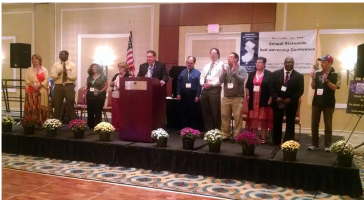
Pictured above, Self-Advocates at the 2015 Conference.