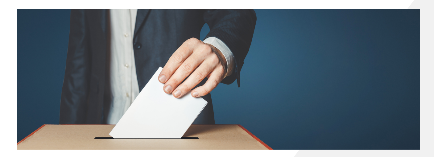
This year's ballot will include 3 public questions.

Public Question #1 - Do you approve amending the Constitution to legalize a controlled form of marijuana called "cannabis"? If approved, only persons at least 21 years of age could use cannabis products legally. The Cannabis Regulatory Commission would oversee the new adult cannabis market. All retail sales of cannabis products in the new adult cannabis market would be subject to the State's sales tax. If authorized by the Legislature, a municipality may pass a local ordinance to charge a local tax on cannabis products.