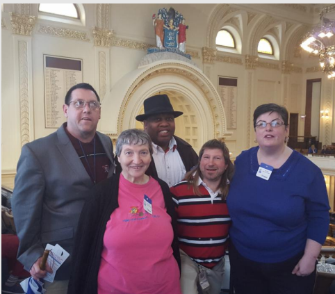
Pictured Above: Self-Advocates visit the State House during last year's DD Awareness Month event.

In honor of Developmental Disability Awareness month, members of the New Jersey Self-Advocacy Network will travel down to Trenton today to raise awareness about the issues impacting people with intellectual and developmental disabilities. They will speak to legislators in Goldfinch Square and highlight this important occasion. In addition to their trip to the Capital, the NJ Self-Advocacy Project is sponsoring their annual DD Awareness Month Bulletin Board Student Contest. This year's theme is: "Developmental Disabilities Awareness: It Matters to Me." The student contest is a way of promoting inclusion and education to students in elementary, middle and high school. Winning submissions will be exhibited at the State House as part of the Self-Advocates' display. For more information, click here .