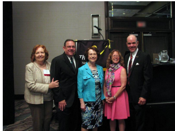
Pictured Above: Staff and speakers at the 2016 Mainstreaming Medical Care Conference.

The 28th Annual Conference on Medical Care for Persons with Developmental Disabilities hosted by the Mainstreaming Medical Care Program of The Arc of New Jersey will be held on Friday, June 2 at the Westin, Princeton. More information can be found at www.mainstreamingmedicalcare.org