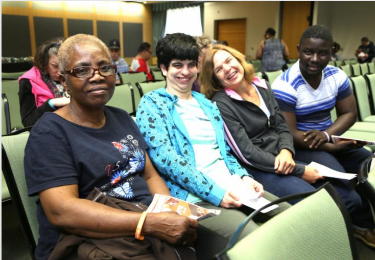
Pictured Above: Attendees at the 2016 Sprout Film Festival waiting for the screening to begin.

After a very successful inaugural year, the Sprout Film Festival will be back in New Jersey on Saturday, April 29, 2017 Middlesex County College West Hall, Parkview Room . Come join us for a screening of some of the most creative and heart-warming short films by and about people with intellectual and developmental disabilities from around the world. For more information go to Sprout .