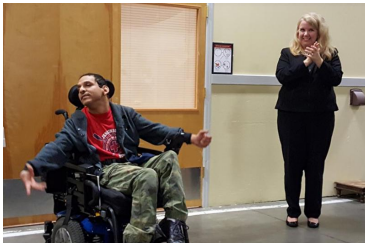
One of the program participants speaks about his experiences with DSPs.