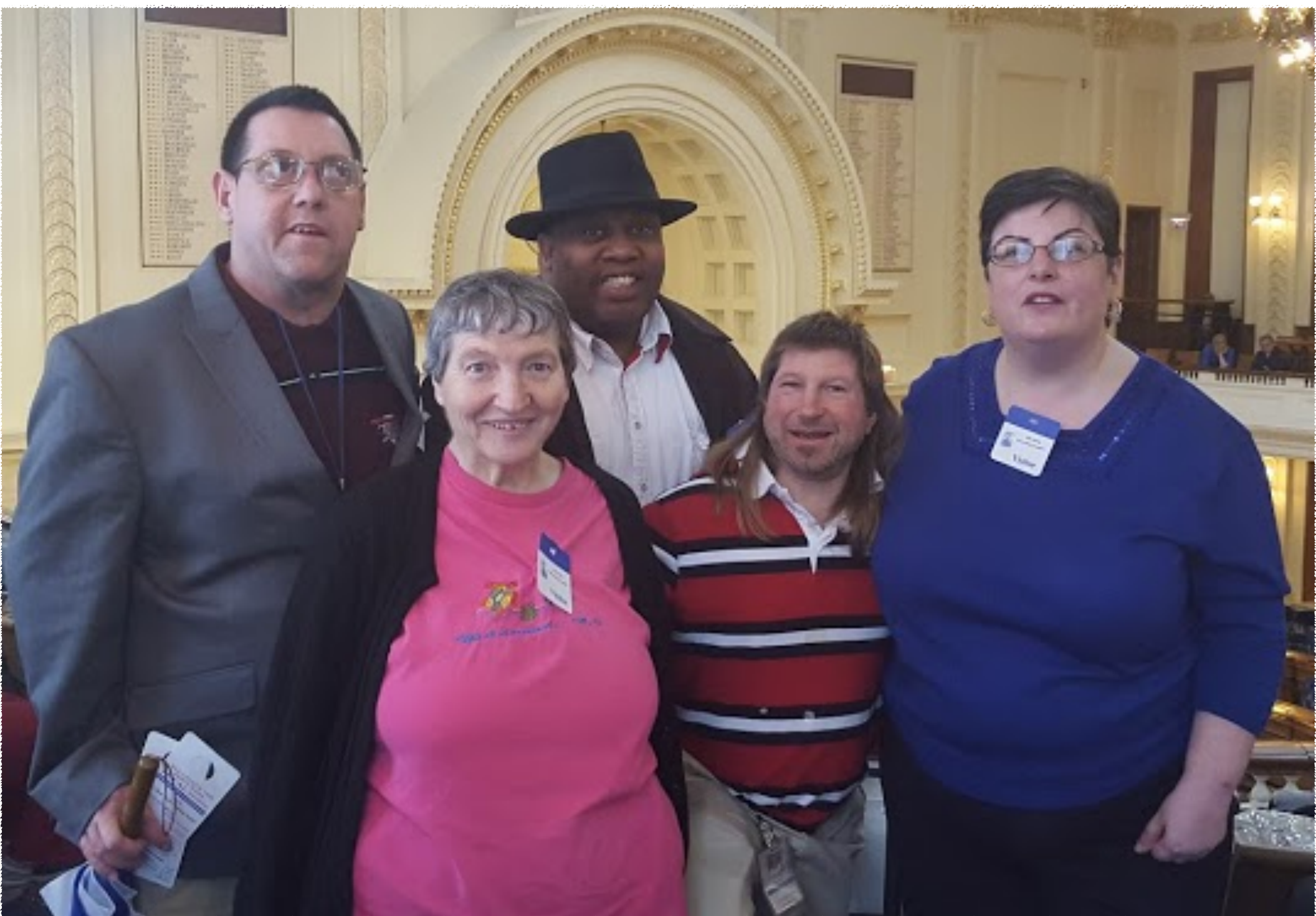
Self-Advocates with The Arc of Somerset County tour the State House