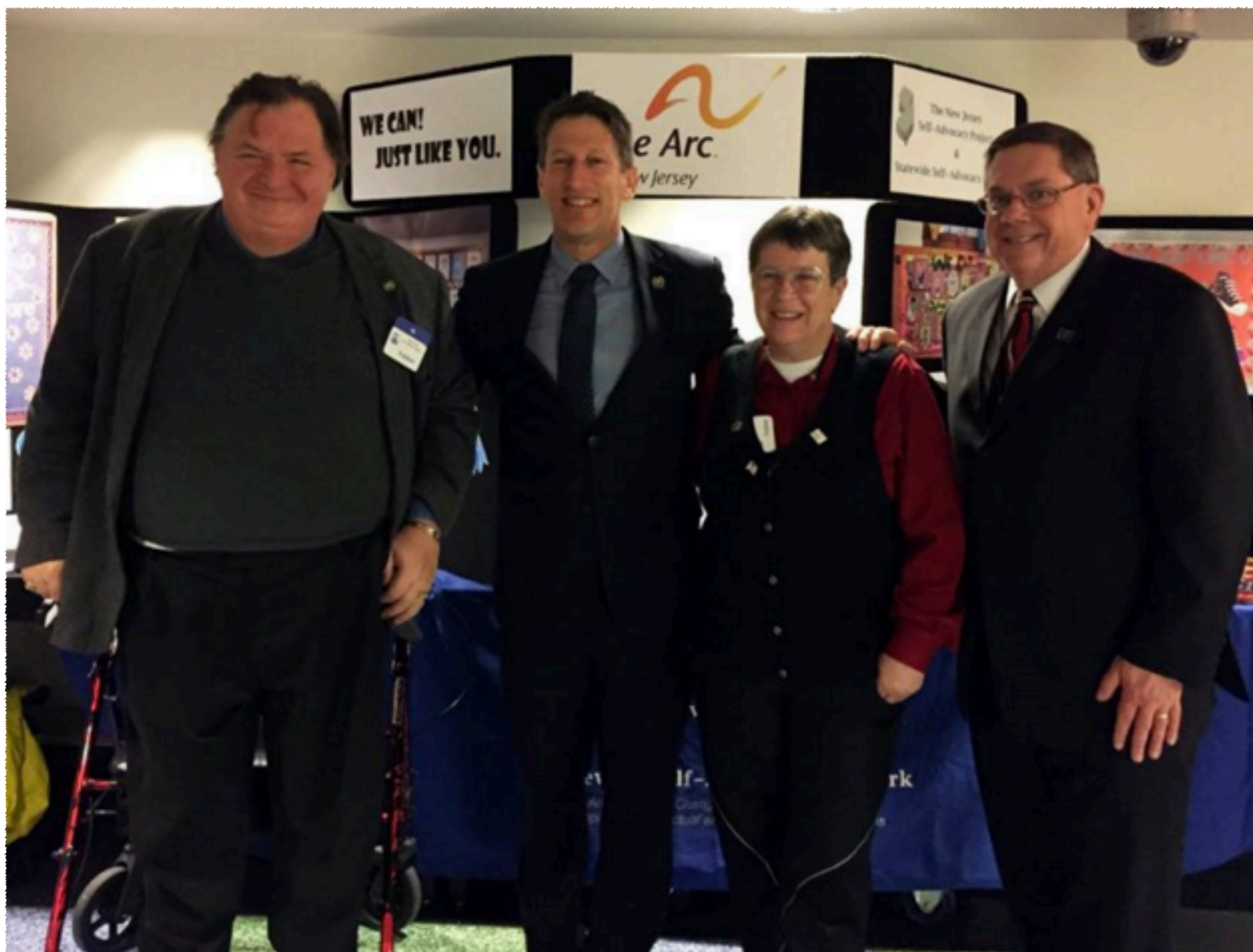
Members of the NJSSAN greet Assemblyman Zwicker (center)