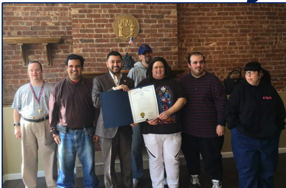
March 2017: Advocates from Hudson County accept an Assembly Resolution in honor of Developmental Disabilities Awareness Month presented by Assemblyman Mukherji