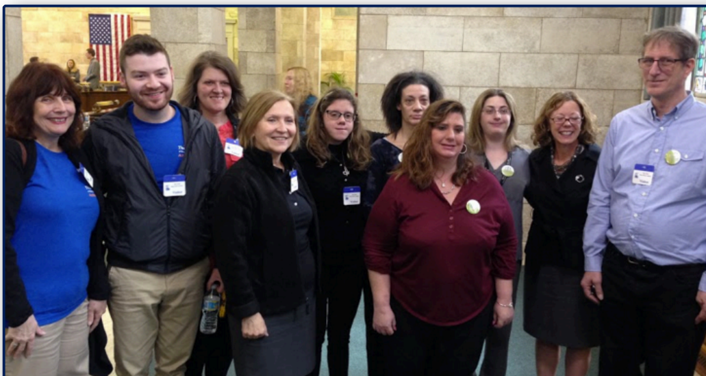
May 2017: Members of the New Jersey Statewide Self-Advocacy Network meet with Commissioner Connolly following a Senate Budget Committee Hearing at the State House