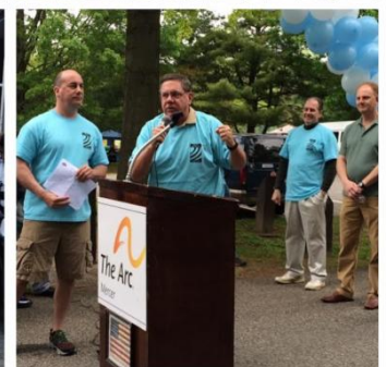
Top Left: The Arc Middlesex, Top Right: The Arc Burlington, Bottom Left: SCARC, Bottom Right: The Arc Mercer

Step Up For The Arc is an annual statewide initiative of The Arc of New Jersey, with walkathons held locally by every county Chapter. Check out these photos from recent events, and be sure to sign up for the last walk of June at The Arc of Ocean County . Walks will resume in September, so check out this site for more details and dates.