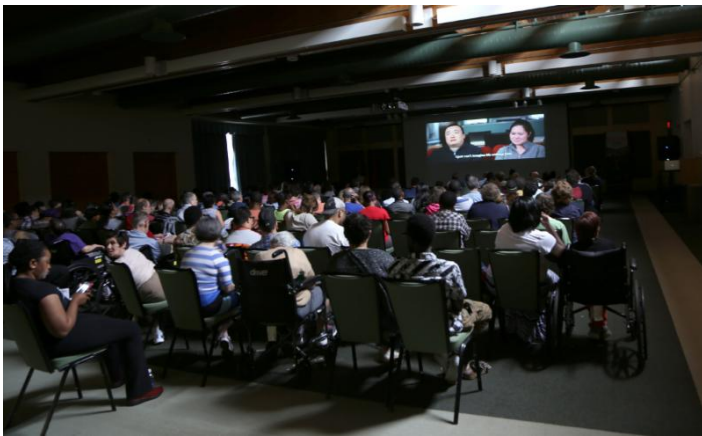
Audience members watch a short film about people with I/DD.