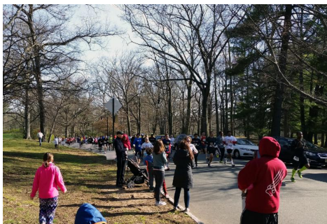
Pictured Above: Walkers participated in

Spring is here and that means it's time to grab your favorite pair of sneakers and Step Up for The Arc 2016! Step Up For The Arc is an annual statewide initiative of The Arc of New Jersey, with walkathons held