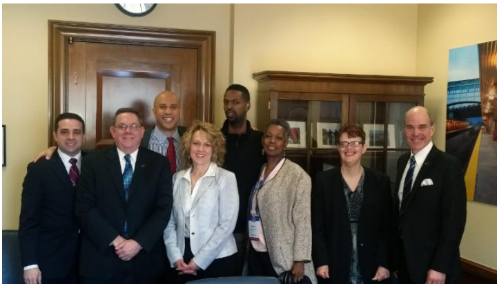
Pictured Above: Representatives from The Arc of New Jersey and the NJ Council on Developmental Disabilities met with US Senator Cory Booker about federal issues impacting people with intellectual and developmental disabilities.

The Arc of New Jersey attended the annual Disability Policy Seminar in Washington, DC last month and then visited with members of New Jersey's congressional delegation. The informational sessions at the Seminar focused on threats to the lifeline programs which people with I/DD depend upon, as well as newly proposed provisions to the ABLE Act and special education issues. During our meetings with legislators, we advocated for their support against any potential cuts to Medicaid/Social