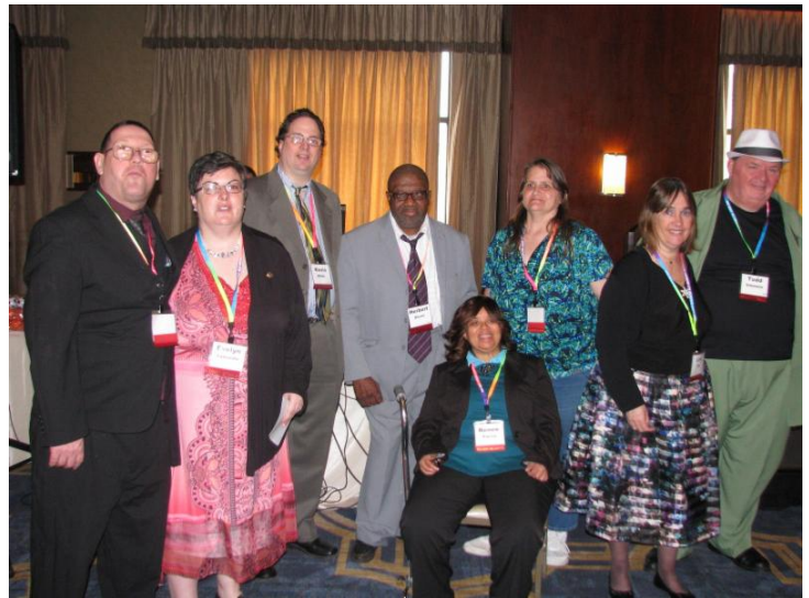
Pictured Above: Members of the NJ Statewide Self-Advocacy Network Advisory Board celebrate at the 11th Annual Spring into Action Luncheon.

The New Jersey Statewide Self-Advocacy Network bestowed honors upon this year's award winners and recognized outstanding achievements from 2015/2016 at the 11th Annual Spring Into Action Luncheon at the Imperia in Somerset. Approximately 300 self-advocates from across the State attended the event and representatives from each Council delivered reports about the work their groups are doing. To view photos from this outstanding event, be sure to visit our Facebook page .