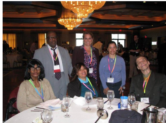
Pictured Above: Attendees at the 2016 Spring into Advocacy Luncheon.