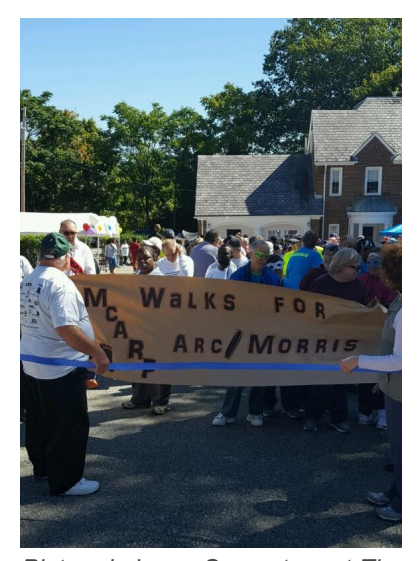
Pictured above: Supporters at The Arc/Morris annual walk which was held on Saturday, September 25th.

Looking to make a donation in the meantime? Be sure to contact the <u>local county</u> <u>Chapter</u> in your area.