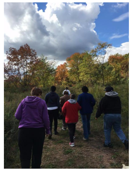
Pictured above: Self-Advocates going on a trail walk at last year's Watchung Reservation event.

Wednesday, October 5. HLP is a project of The Arc of New Jersey and receives funding through a grant awarded by the Horizon Foundation for New Jersey. The goal of the project is to provide people with I/DD with functional education about the importance of health choices related to diet. exercise, and stress management. The event at Watchung Reservation will include adaptive yoga, a Get Fit Session, lunch,